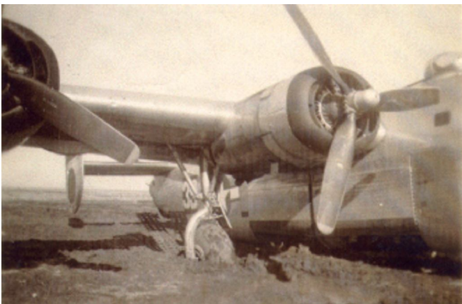
Mired in the Mud after an emergency landing at a fighter squadron's air strip. The runway was too short for the big bomber.

The commander of the fighter squadron was furious at first, and headed out toward the end of the runway in his jeep prepared to give this foolhardy bomber pilot a good reprimand.