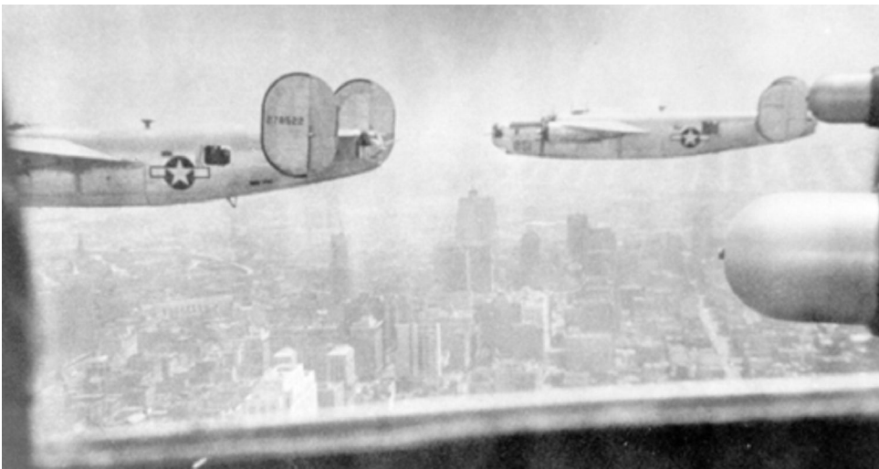
B-24 training flight over San Francisco in early 1944.